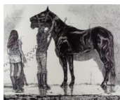
Delaware County Fair, Washing Station

The theme of September's First Friday (9/6, 6-9 pm) is "Celebrate School Spirit." There will be area school mascots, a performance by the OWU Marching Band, and a special teacher-appreciation tent. Attendees are encouraged to wear their favorite school colors.