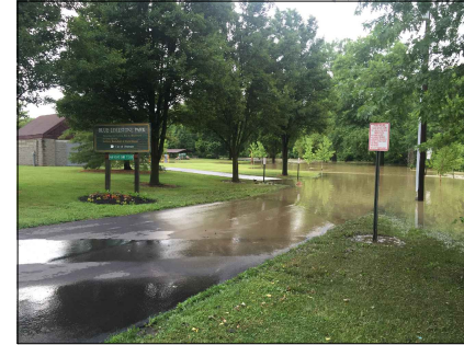
Blue Limestone Park- designing floodable parks to handle more frequent, high intensity storms. Increase park and open space within the floodplain to act as detention and water quality basins.

OHIO WESLEYAN UNIVERSITY- Campus section of run. North and south banks have unique approaches that require diverse solutions.