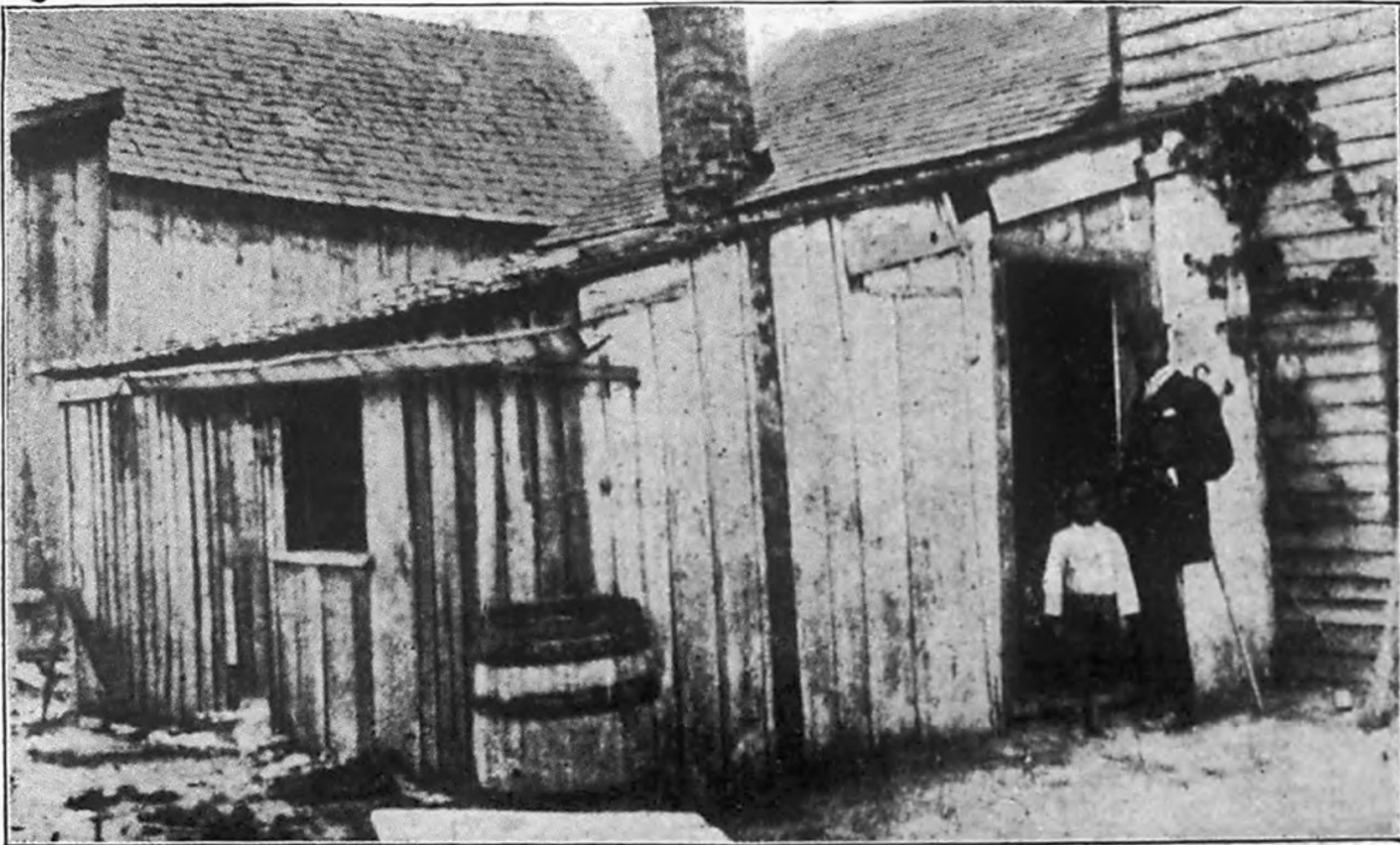
The Shed Kitchen School, 1889.

From the modest beginnings of the “Shed” School, “A Place of Learning for Young and for Old”